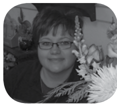
Recieved the "Star of Life" Award