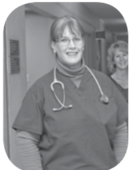
Certified Sexual Assault Nurse Examiner