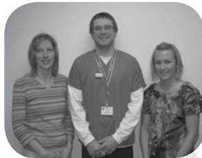
Passed the American Registry of Radiologic Technologists Computed Tomography Certification

of Southwest Healthcare Services who go healthcare to our patients and residents.