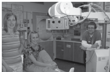
Radiology team with the Portable X-Ray Machine

Thank you for all of your support at the First Annual Celebrity Waiter!