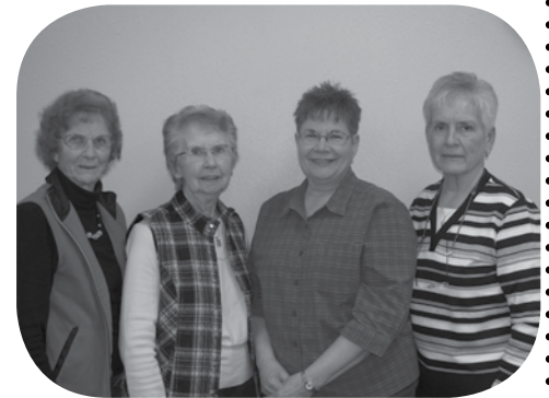
New Auxiliary Officers

In closing, my time as being president has come to an end. It was an honor and a privilege for me to be president of this great organization all these years. I thank all the members for their support, encouragement, and always being there to help. I hope you will support the future officers the same way.