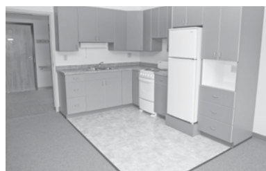
Newly renovated Sunny Apartment

Last year our First Annual Celebrity Waiter was a huge success in thanks to our local community. Because of your generosity we grossed $23,976.53. The money earned was split between a new portable X-Ray machine and renovation of the Sunny Apartments.